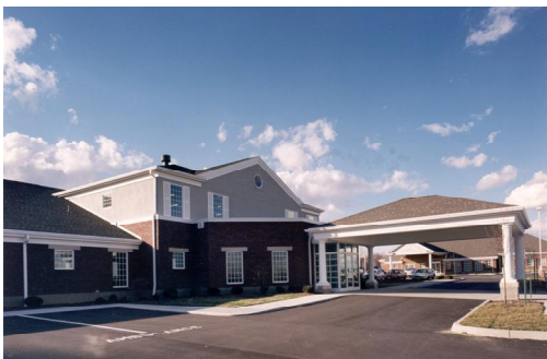
Main (Rear) Exterior Entry